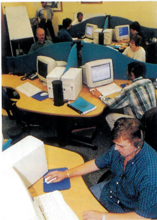
Toshiba Strata: You can't beat free

If you're in dire straits — financially speaking — check out this offer from Toshiba, which is offering to supply the cost free option of ACD functionality for its Strata phone systems.